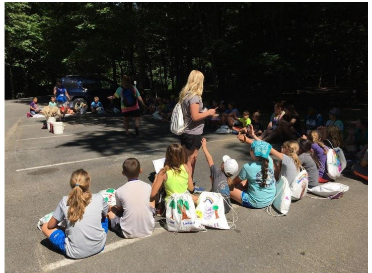
Students with the backpacks they decorated, wait for the buss to take them home after camp.