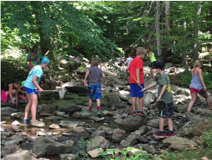
Catching fish and other critters in a stream