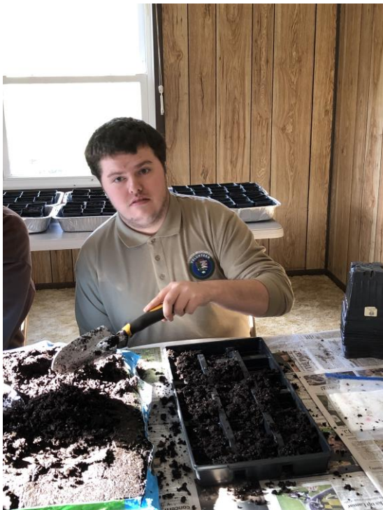
Planting milkweed seeds

Left to right: Separating milkweed seeds from the pods; milkweed seeds in cold storage for a month to condition them to cool temperatures and give them a jump start for early planting; Do Not Disturb sign