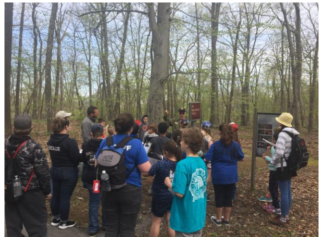
Students enjoy a field trip in the forest.

1200 students here in the park this year! We are very grateful for all the volunteers and the CFA who assist us with this award winning program.