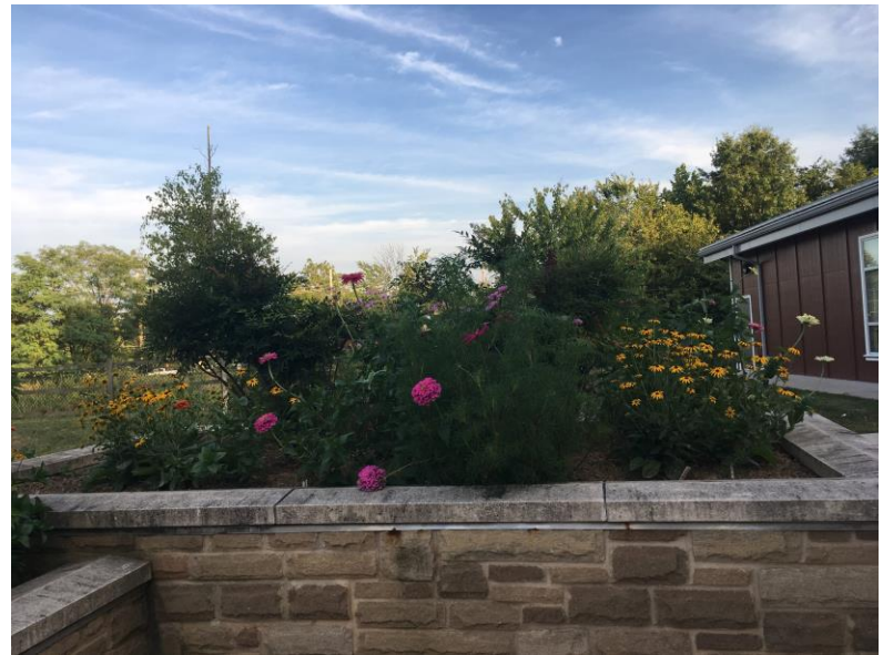
Butterfly gardens at Thurmont Regional Library planted by SUCCESS students and the Thurmont Green Team