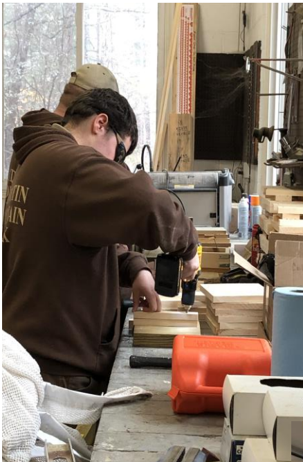
Left: SUCCESS students working on demo kits to be used by the Catoctin Furnace to help students make metal castings of objects.