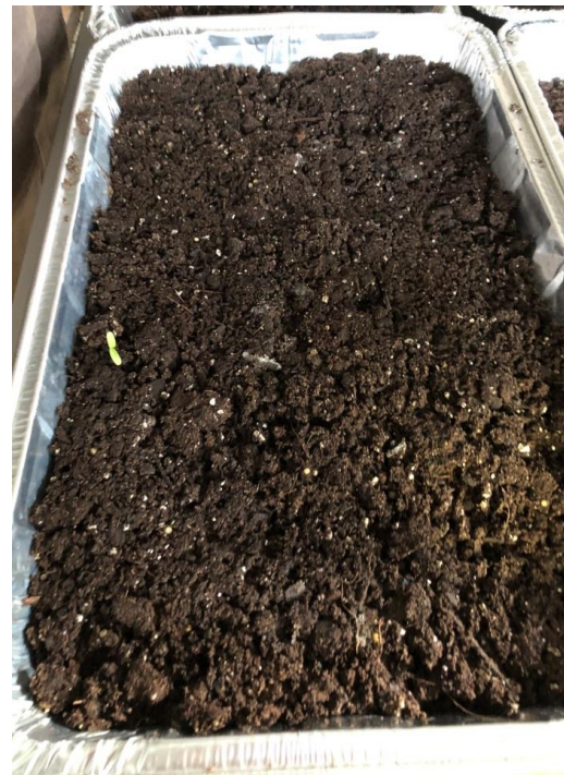
First of many milkweed seeds to sprout