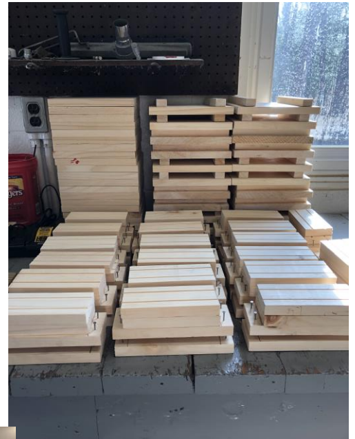
Below: SUCCESS students and leader Jim Robbins working on trail posts for Catoctin Mountain Park.