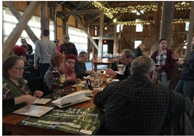
Springfield is a beautiful place to enjoy friends and spend some time together. Scenes from Groundhog Day at Springfield (2019)