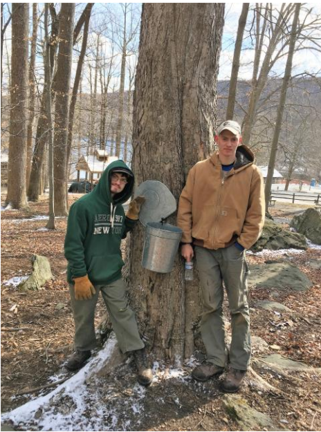
Maple Syrup collection