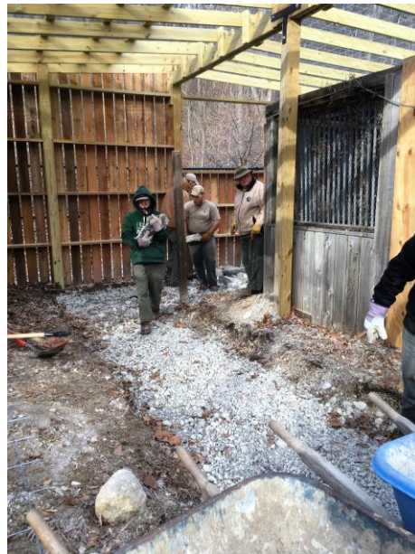
Working at the Aviary at Cunningham Falls State Park