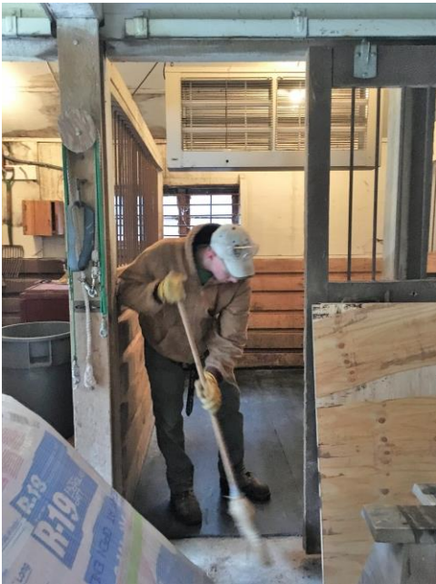
Cleaning horse stalls