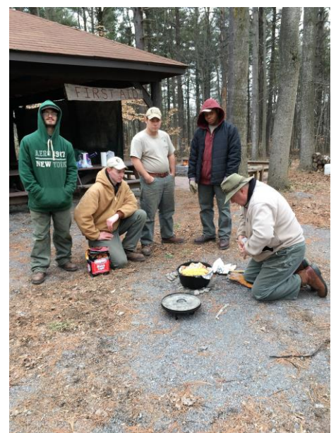
Dutch Oven cooking and LUNCH