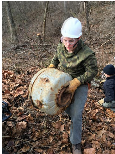
Cleaning up trash