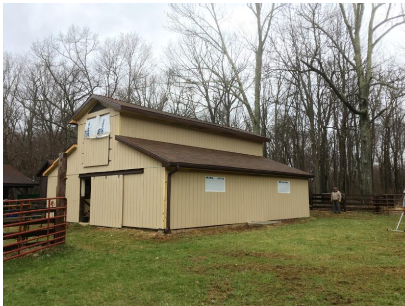
Horse barn renovation nearly complete