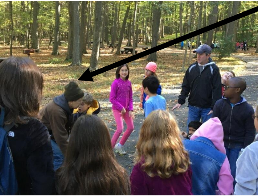
The alien “Katrinka” bug invades the 4 th grade tree.