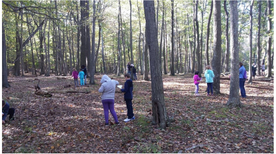
Students make bark and leaf rubbings as part of the “Tree Factory” activity.