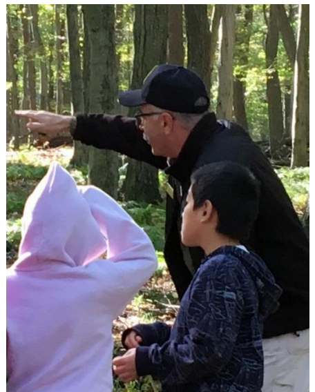
Young scientists learn how plants adapt to survive in a real world setting on the Spicebush Nature Trail